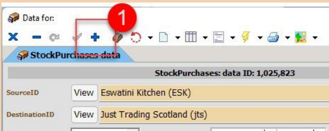
Insert new Stock Purchase record, in Edit Window

If the "StockPurchases" Edit Form is not open, find the "SystemEntities" screen, locate the "Stock Purchases, Stock Purchase Items" Entity, click the "Actions" button and select "Add New StockPurchases" (marked 1., in the image).